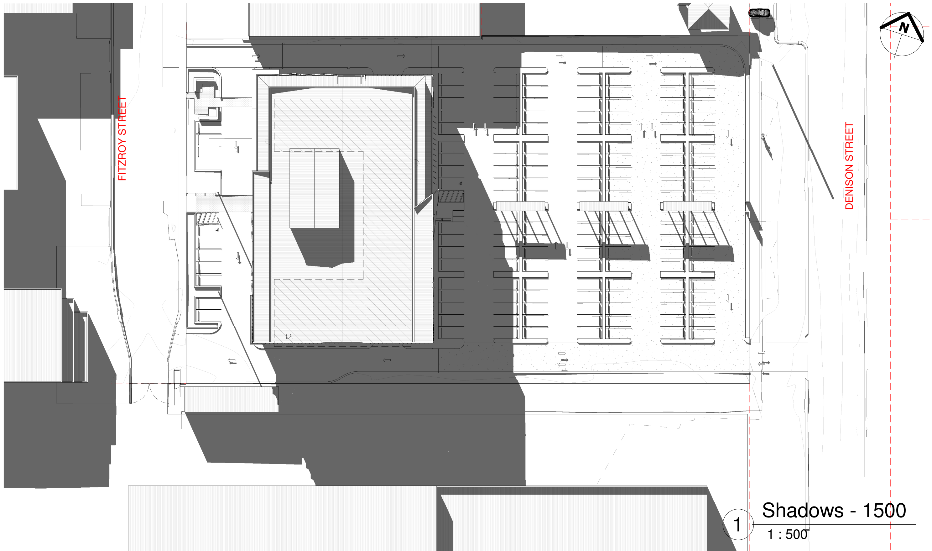
Shadows - 1500